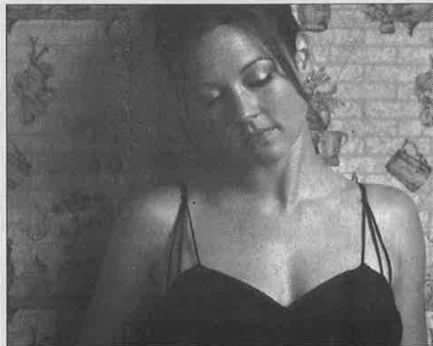
She sings and plays fiddle, ukulele, and other strings: Amanda Shires